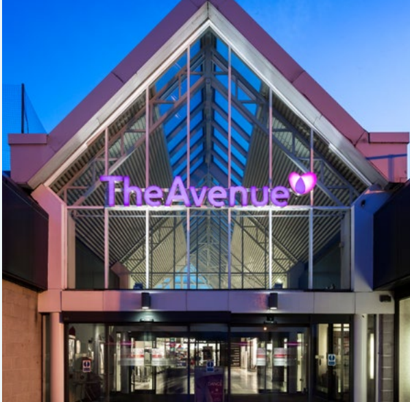
4.5m footfall p.a.